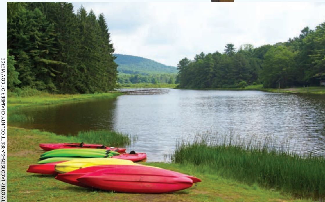
TIMOTHY JACOBSEN-GARRETT COUNTY CHAMBER OF COMMERCE

Deep Creek Lake State Park, includes a challenging network of mountain biking trails and a well-marked trail system includes a hike to a lookout tower with exceptional views of western Maryland. The Discovery Center mixes learning and fun with exhibits on turtles, foxes, black bears and an on-site aviary of rescued and rehabilitated birds of prey.