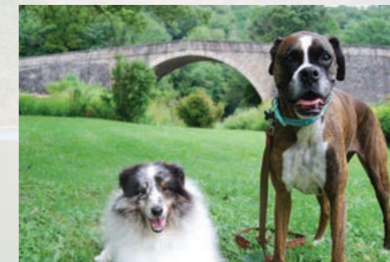
Most areas are leashed dog friendly and pet approved.

Maryland's highest free-falling waterfall, the 53-foot Muddy Creek Falls, is one of four waterfalls within Swallow Falls State Park, also popular for a stand of hemlock trees over 300 years old.