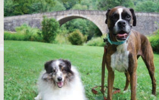
Most areas are leashed dog friendly and pet approved

Maryland's highest free-falling waterfall, the 53-foot Muddy Creek Falls, is one of four waterfalls within Swallow Falls State Park , also popular for a stand of hemlock trees over 300 years old.